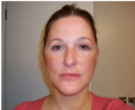
Day 4 without makeup

I am going back to work tomorrow morning so I better get my beauty sleep. I put my compression garment back on and ice and off to bed with me.